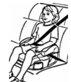
Belt Positioning Booster