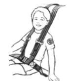
Lap Belt with Harness

WARNING: Belt-positioning booster seats must NEVER be used with just a lap belt. Belt-positioning booster seats can only be used with lap and shoulder safety belts.