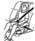
Belt Positioning Booster